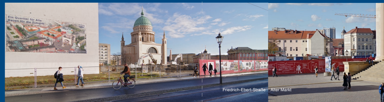
Friedrich-Ebert-Straße Alter Markt