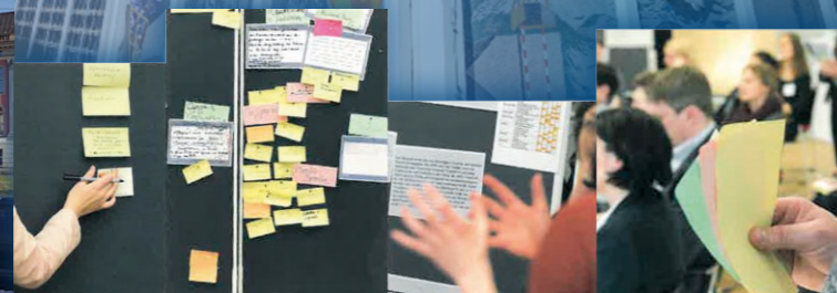
Creative Quarter, Workshop processes for the arts, cultural and creative industries

The study is to be completed by 2019 and will serve as the basis for further steps and the ultimate execution of the project.