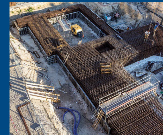
The tower's base area before the foundation plate was cast

The reconstruction of Garrison Church takes place under the triad of remembering history, learning responsibility, and living reconciliation. The tower will become a learning environment for history, a centre for peace, education, and reconciliation work.