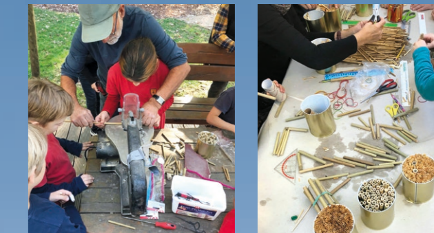
Youth participation campaign

With the completion of the first construction phase in spring 2019, the planned facilities for play, sports, and exercise will be available to both school children from the Max Dortu Primary School and visitors.