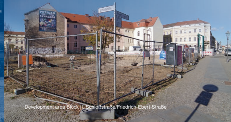
Development area Block II, Schloßstraße/Friedrich-Ebert-Straße

The building application for the neighbouring "Haus Einsiedel", whose predecessor building „Zum Einsiedler“ (Hermit's House) was also destroyed during the war, will be submitted in 2019. The historical design will be interpreted with contemporary architecture. The savings bank will be on the ground floor with 15 flats currently planned for the upper floors.