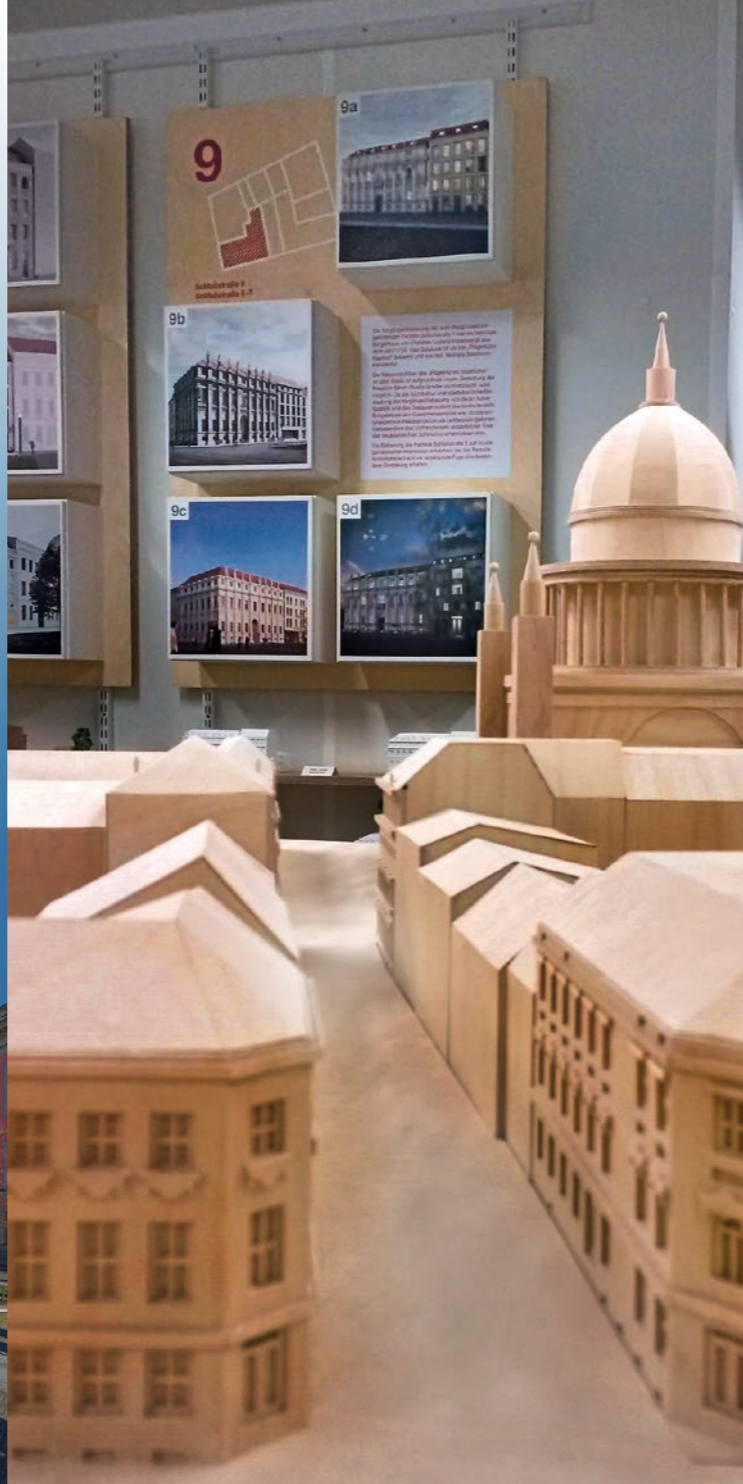
Model of Schwertfegergasse in the Info Centre