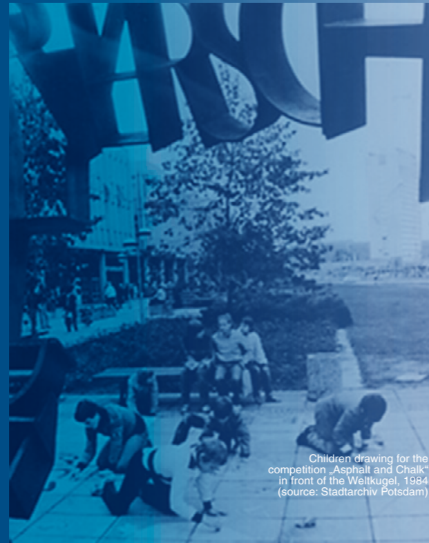
Children drawing for the competition „Asphalt and Chalk“ in front of the Weltkugel, 1984

In Potsdam, the advisory board for public art is in charge of finding, assessing, and recommending sites for new works of art or for those that can no longer be displayed in their current location. Its recommendations are not binding but are usually implemented by the city administration.