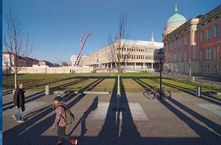
Hard shadow of Ringerkolonnade at Steubenplatz in front of the former university building

Demolition of the building began in November 2017 with the removal of contaminated building material, which was dismantled, sampled, and properly disposed of under strict conditions and without affecting the environment. Demolition of the load-bearing building structure is expected to begin in spring 2018, moving from north to south. The last step will be deep-rubble removal by autumn 2018, preparing the site for new development.