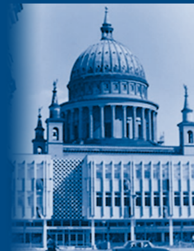
View along Friedrich-Ebert-Strasse to St. Nicolas Church, mid 1970s

Public parking is not being provided in this area in order to reduce traffic and to increase amenity value for pedestrians and cyclists.