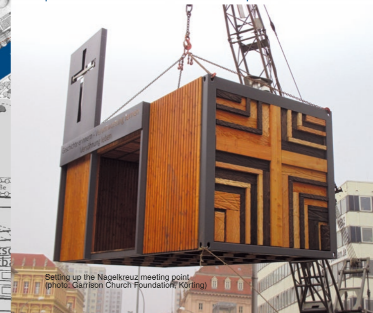
Setting up the Nagelkreuz meeting point

Initially, though, it goes in-depth: 38 piles are driven 38 meters into the ground to anchor the superstructure. Starting in May 2018, the tower will visibly grow brick by brick. The finished tower will be built with about 2.5 million bricks, using old, traditional construction methods. This will bring to life a decade-long vision of many Potsdamers. Generous donations from all over Germany also show the growing interest in and positive attitude for this ambitious construction project. The Nagelkreuz meeting point will provide information on the construction process.