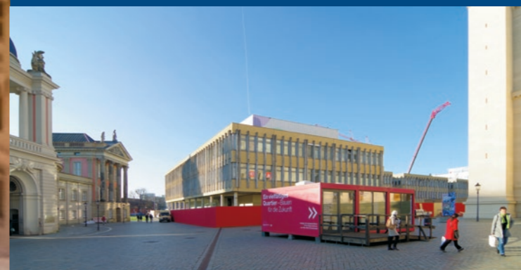
"Red Infobox" on Alter Markt, in the background, the info fence

The photo on the left shows a model of how the first of two blocks at the site of the former university building might look. It was taken during a public presentation of the submitted construction and utilization concepts in November 2017.