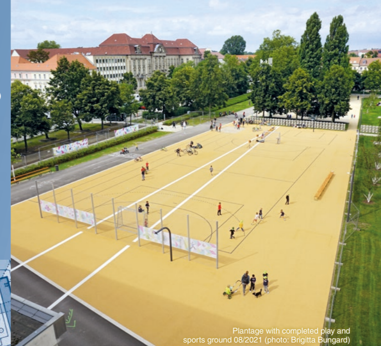
Plantage with completed play and sports ground 08/2021

Source maps: Potsdam-Stadtkarten scale 1:500/ Individual project plans of the architects/ historical lines according to Dt. Städteatlas - Potsdam, sheet 3. Maps/montage/drawings: ASTgrafik © 2022 Sanierungsträger Potsdam GmbH