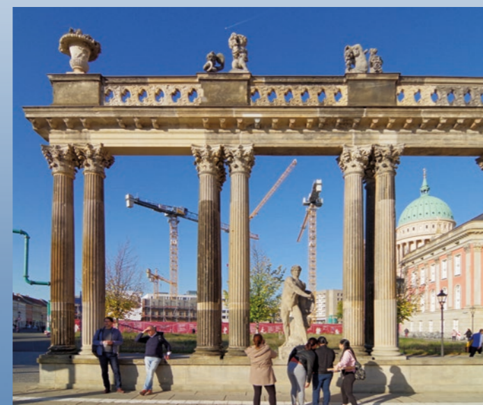
Ringerkolonnade with vases, putti and "Swordsmen", in the background the construction site of Block III 10/2021

The structure no longer has a separating effect. Time and again, passers-by appreciate the opportunity to enjoy the sun between the columns and in the company of the silent gentlemen made of sandstone and to let urban life pass by.