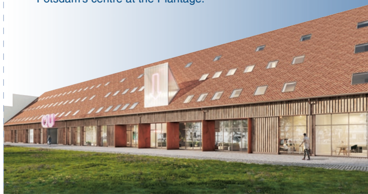
First construction stage "Langer Stall" at the Plantage (visualization: Michels Architekturbüro GmbH)

Currently, art and culture professionals temporarily use the building of the former computer centre. The new Kreativ Quartier is also meant to give the cultural and creative industries a permanent home in Potsdam's centre at the Plantage.