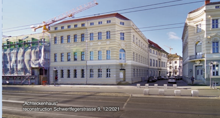
"Achteckenhäuser" reconstruction Schwertfegerstrasse 9, 12/2021

The foundation stone for the new Potsdam Synagogue was laid in Schlossstrasse on 8 November 2021. The decision to build a new synagogue at this location dates back to the early 2000s. The state of Brandenburg is the builder of this complex and currently expects to complete it by the end of 2023.