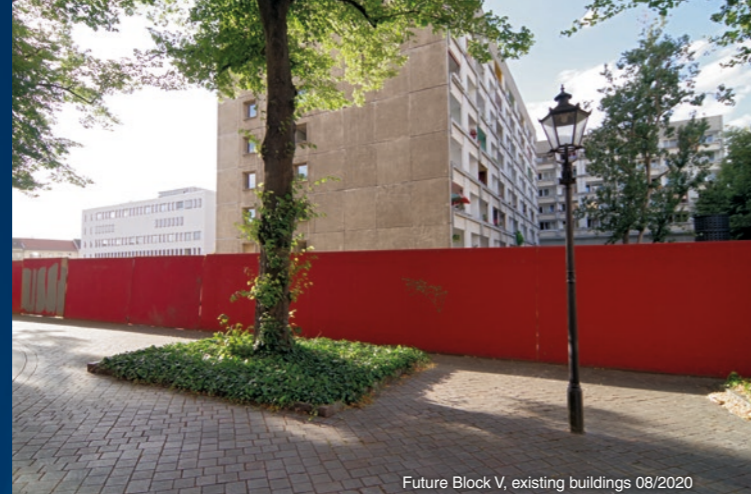
Future Block V, existing buildings 08/2020

Background photo: "Standing Wrestlers", former colonnade between Royal Stables and City Palace (SPSG) Cover photo: Potsdam's city centre, construction site of Block III, Fr.-Ebert-Str. 09/2021 (AST)