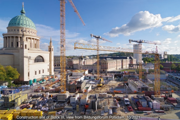
Construction site of Block III, view from Bildungsforum Potsdam, 10/2021