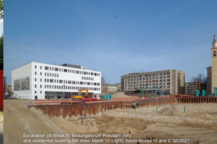
Excavation pit Block III, Bildungsforum Potsdam (left) and residential building Am Alten Markt 10 (right), future blocks IV and V, 02/2021

Preparing the development plan SAN-P 20 "Am Alten Markt/ Am Kanal" will create the legal basis for the implementation of the now defined redevelopment goals in accordance with zoning and planning law. The development of Block V north of St. Nicolas Church completes the implementation of the landmark building concept and thus the urban redevelopment around Alter Markt.