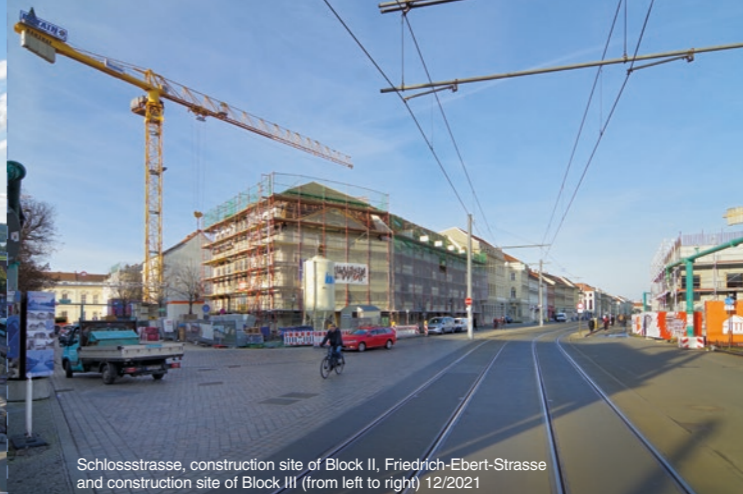
Schlossstrasse, construction site of Block II, Friedrich-Ebert-Strasse and construction site of Block III (from left to right) 12/2021

The ground-floor areas of the buildings will feature various stores, a "House of Music" and restaurants to ensure that Potsdam's city centre continues to be an interesting place for Potsdam's citizens and visitors.