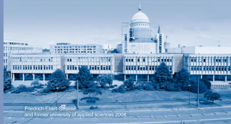
Friedrich-Ebert-Strasse and former university of applied sciences 2008

As in Blocks I - III, clear specifications must be met in terms of design. The exact appearance of the houses will be determined in architectural competitions. The first designs will be finalized and presented to the public in the first half of 2022. Construction is expected to start by the end of 2023.